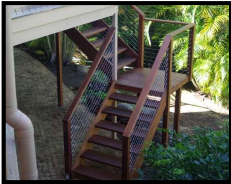
Timber staircase and railing with metal spindles