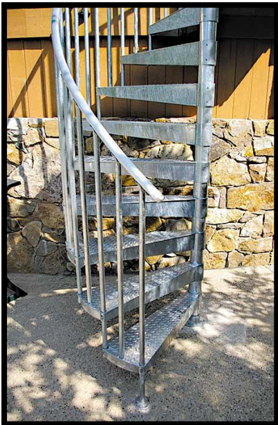
Galvanised staircase and railing