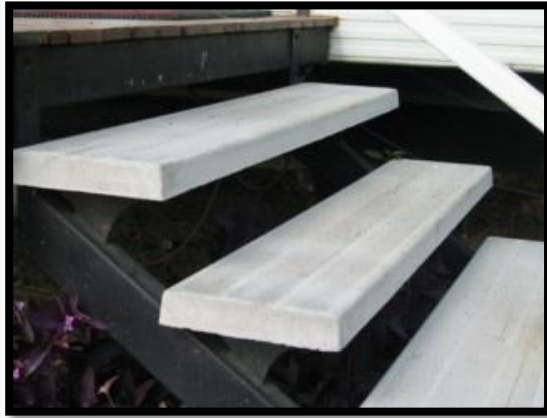
Concrete open tread stairs