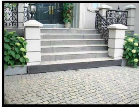
Concrete stairs with wrought iron railing

Designing and choosing external stairs can be great fun and an excellent way to add character and function to your home, but be sure to check with your local Council if any building permits are required for the installation of new external stairs. Also, as with any projects around the home, don't forget to consider how the design and materials will ultimately affect maintenance and durability. If you look after your home, it will look after you!