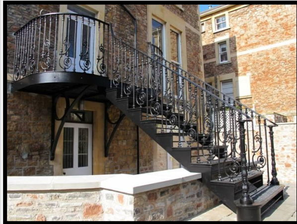
Metal staircase with elaborate wrought iron spindles and railing